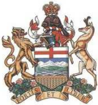
Alberta Coat of Arms

As of 2004, Alberta had had five visits by the Queen. The first was in 1951.