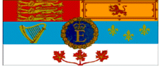
The Queen's personal Canadian Flag (standard)