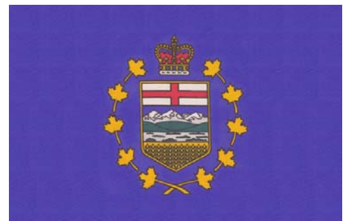
Lieutenant governor of Alberta's Standard (Flag)

Visit www.assembly.ab.ca/lao/library/lt-gov/index.htm for pictures and biographies of all of Alberta's Lieutenant Governors.