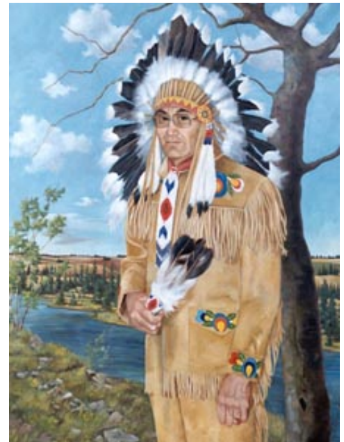
The Honourable Ralph G. Steinhauer, 1974-79

In Alberta, there are 44 first Nations in three treaty areas: Treaty 6 signed in 1876 at Carleton and Fort Pitt; Treaty 7 signed in 1877 at the Blackfoot Crossing of the Bow River and Fort Macleod; and, Treaty 8, signed at Lesser Slave Lake in 1899.