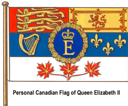
Personal Canadian Flag of Queen Elizabeth II