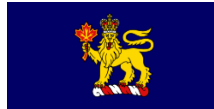
Flag of the Governor General

*Don't forget the provincial Crowns – each province has a lieutenant governor that represents the Queen, each with their own distinct symbols and traditions. Explore Canada's lieutenant governors using the links listed on this handout.