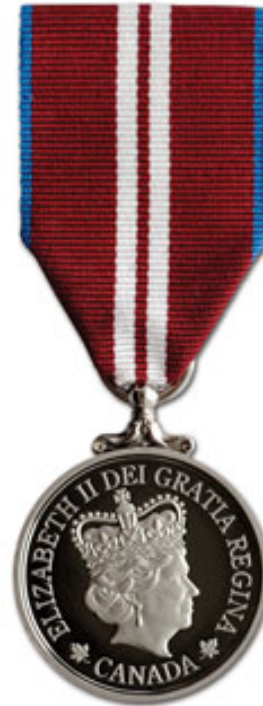
Diamond Jubilee Medal, Canada