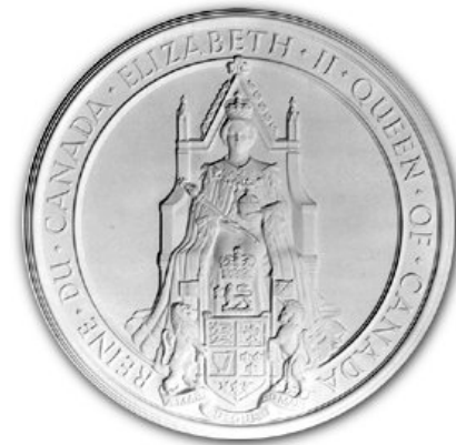
The Great Seal of Canada

Check out the following websites for more information: