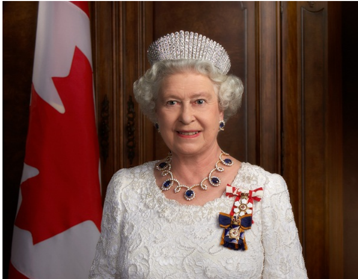
Queen Elizabeth II wearing her insignias as Sovereign of the Order of Canada and the Order of Military Merit