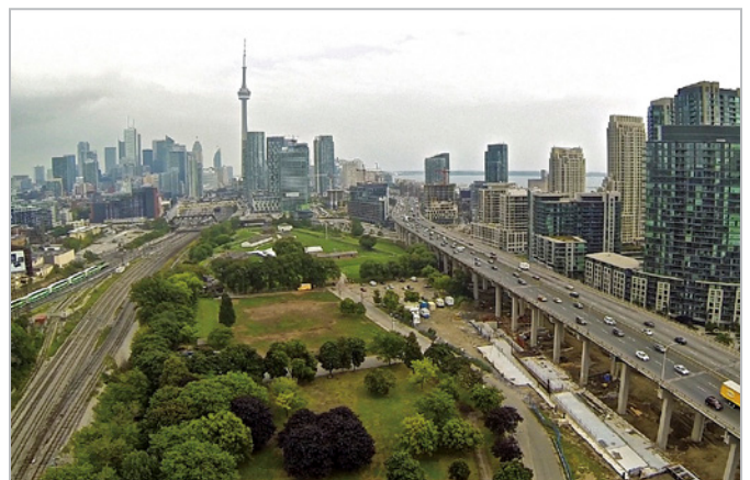
An aerial view of the fort looking east shows the substantial progress on the Visitor Centre that's been made over the summer.

TD Bank Group also donated $50,000 towards supporting War of 1812 Bicentennial educational programs at the City's historic sites. Participating museums include Fort York, Mackenzie House, Colborne Lodge, Montgomery's Inn, and Gibson House. The donation makes it possible for students of the Toronto District School Board and the Toronto Catholic District School Board to attend the educational programs at no cost. Almost 2000 students have already participated in the program, which will continue through June 2014.