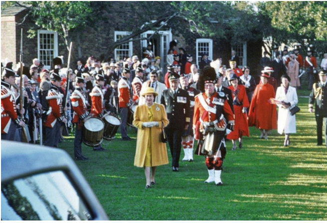
HM Queen Elizabeth's visit to Fort York in September 1984, on the occasion of Ontario's Bicentennial and Toronto's Sesquicentennial, underlined the fort's links with the Crown. Here she is seen leaving the Officers' Mess.

celebrations. Queen Elizabeth II visited Fort York for a garden party from 4 to 5:20 pm on September 29, also hosting a luncheon in the Officers' Barracks and Mess Establishment.