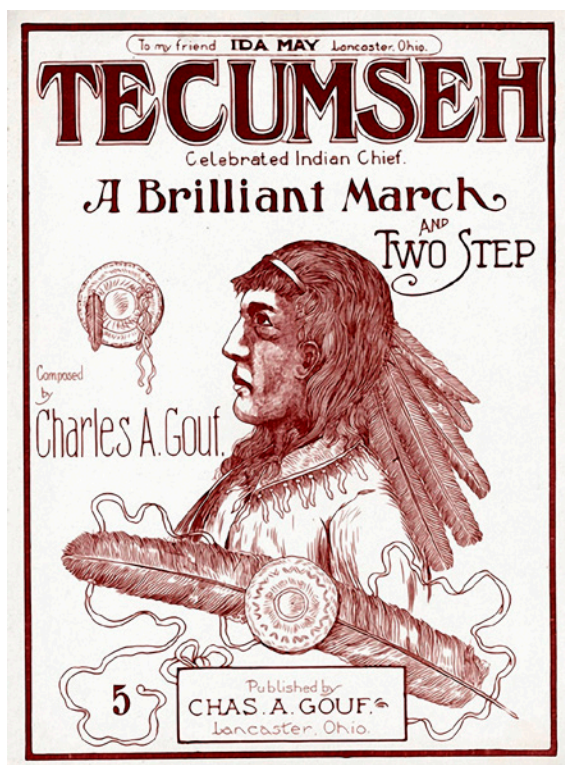
Sheet music like this march and two-step published in Ohio in 1906 is one of the many forms in which Tecumseh's name has been carried forward.

The perception of Tecumseh as the vanquished enemy launched the presidencies of Andrew Jackson, William Henry Harrison, and Zachary Taylor. Simultaneously, the popular notion of Tecumseh as the last great Noble Savage led to the naming of countless towns, streets, and schools—particularly west of the Mississippi River, where, ironically, the Indian Wars would continue for decades. Novelists, songwriters, playwrights, and later film and television directors, glorified him, putting him on par with Leatherstocking and Wild Bill Cody as the quintessential frontier icon. They stripped him of his ability to speak English, dressed him up in stereotypical garb, and romantically linked him to beautiful pioneer girls in Ohio. Marketers, in turn, exploited his increasingly circulated name to sell cigarettes, chewing gum, flour, refrigeration equipment, and engines.