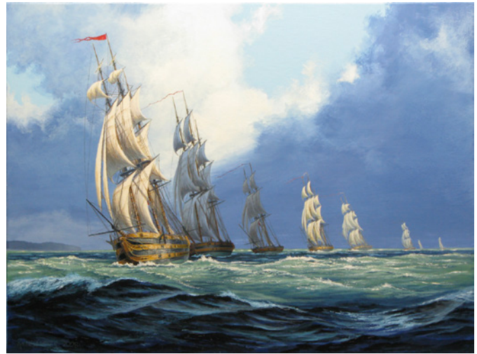
The British squadron on Lake Ontario, early November 1814. The ship-of-the-line St. Lawrence, flying Commodore Sir James Lucas Yeo's broad pendant, leads the frigate Prince Regent and the rest of Yeo's squadron as they sail from Kingston to Niagara.