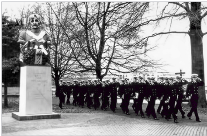
Midshipmen at the US Naval Academy, Annapolis, MD, march past the bust of 'Tecumseh' who has a large role in the school's traditions. It is a bronze replica of the figurehead of the USS Delaware carved originally to represent Tamanend, a Delaware chief.

marks and success on the field, rather than Metacom or any other historical figure for that matter, says much about his legacy in popular culture. As The North American Review put it in 1832, Metacom “lived at a period, and among a people, which gave him some prospect of success. But Tecumseh's exertions were hopeless. He was feared too little to be duly appreciated, as the other was feared too much.” Less than two decades after his death, Tecumseh was perceived as America's