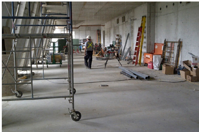
About 80% of the concrete shell of the Visitor Centre has been poured, and the interior spaces are now taking shape.

David Spittal, senior project coordinator for the Visitor Centre, reports that over 80% of the Visitor Centre's concrete shell, including the building façade and roof, is complete. Mechanical equipment has been delivered, and electrical and other site-servicing work continues. For those visiting the site, our General Contractor, Harbridge + Cross, has installed the first weathered steel panel at the far west end of the building. This first panel was installed early as a test panel. The building itself is expected to be substantially complete by the end of May 2014, with exhibit installation and landscaping scheduled over the summer months. An official opening date has yet to be finalized.