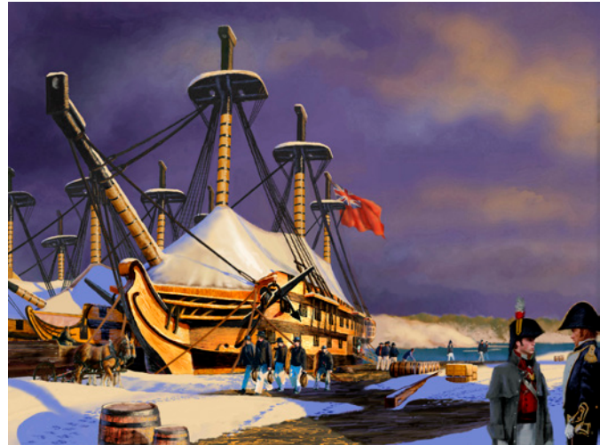
Kingston Dockyard, December 1814, with the 102-gun ship-of-the-line St. Lawrence in the foreground laid up for the winter.